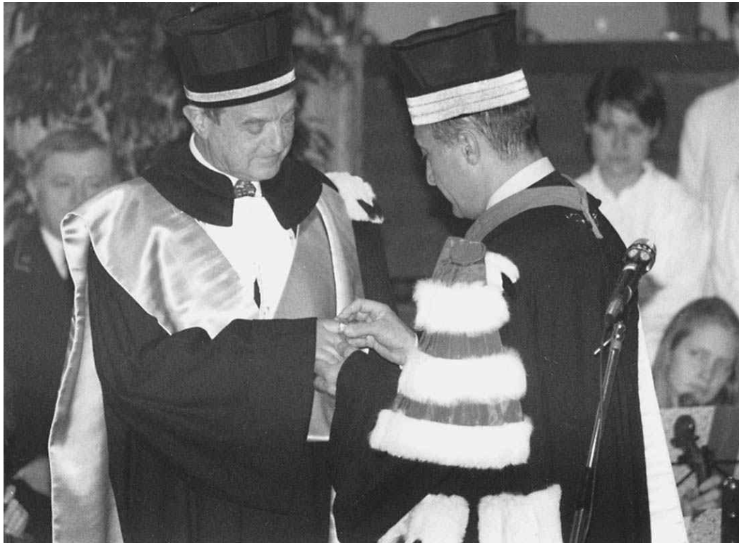
George Soros (left), Mr. Moneybags for the drug-legalization mafia and financial manager for Queen Elizabeth II, receives an honorary degree from Bologna University, October 1995.

the majority of members of the Victorian Royal Household spent their annual holidays at Balmoral Castle, looped on heroin and cocaine solutions. 1