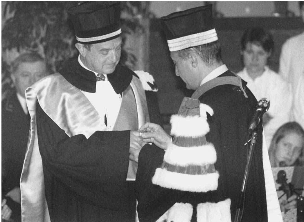
George Soros (left), Mr. Moneybags for the drug-legalization mafia and financial manager for Queen Elizabeth II, receives an honorary degree from Bologna University, October 1995.

the majority of members of the Victorian Royal Household spent their annual holidays at Balmoral Castle, looped on heroin and cocaine solutions. 1